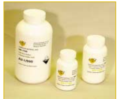
UEI's AU1 Powder Form Etchant