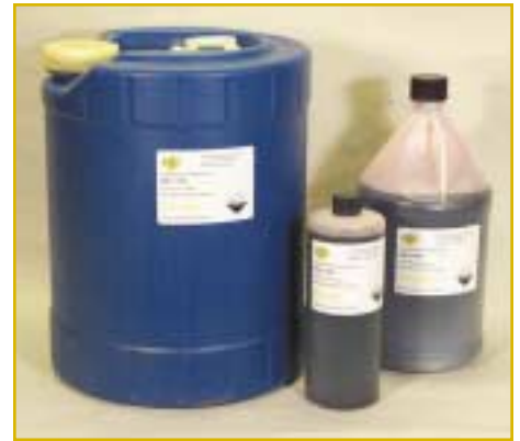
UEI's AU1 Liquid Form Etchant

For more information about UEI and UEI products, call 781-935-8878 or visit www.unionetchants.com .